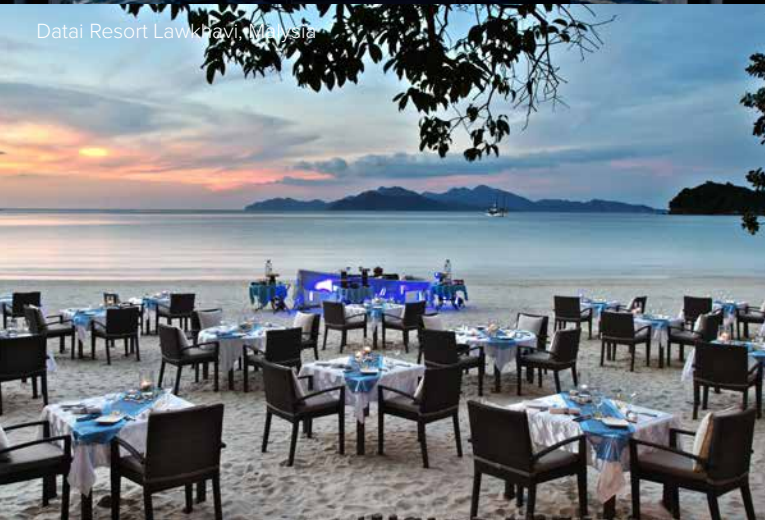
Datal Resort Law, Bali, Indonesia