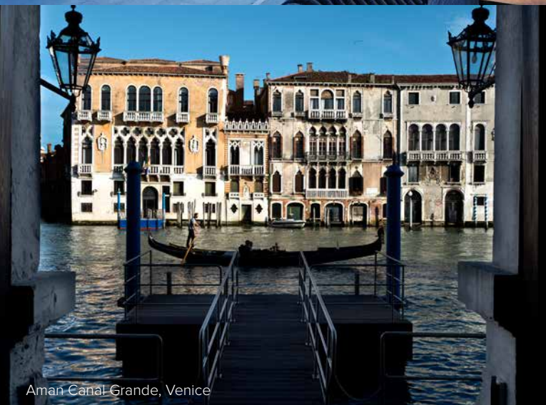
Aman Canal Grande, Venice