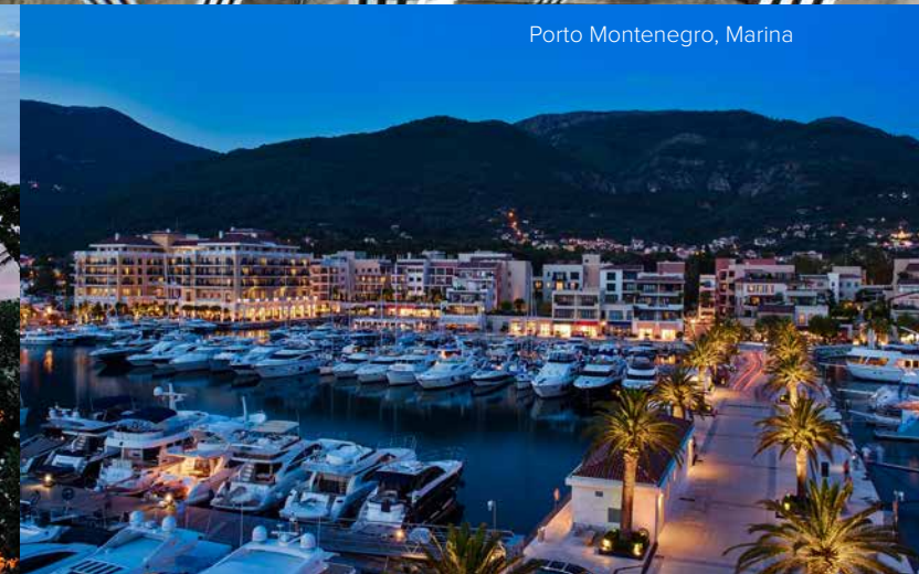
Porto Montenegro, Marina