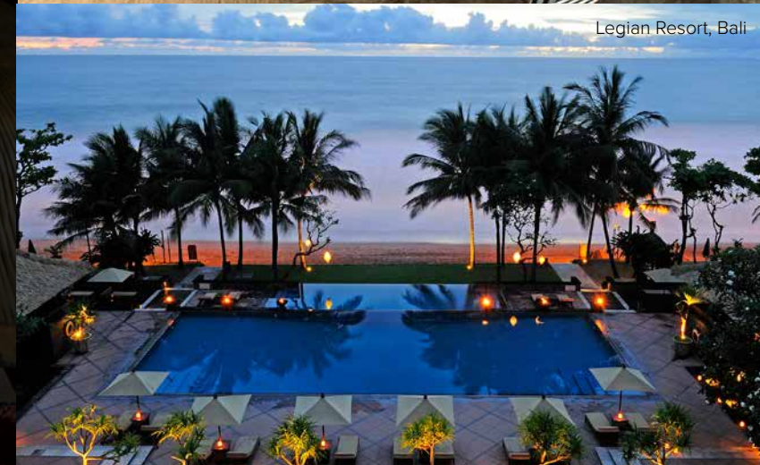
Legian Resort, Bali